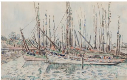
Paul Signac, Concarneau

Stern Pissarro Gallery is thrilled to showcase an exquisite oil painting by the Impressionist master Pierre-Auguste Renoir. With its soft brushstrokes and warm palette, the piece beautifully captures the essence of Renoir's internationally acclaimed landscapes. As 2024 marks 150 years since the first Impressionist exhibition, the inclusion of a Renoir piece of this calibre on their stand is particularly relevant and presents collectors with an exciting opportunity.