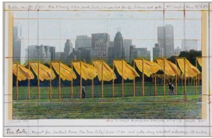
Christo, The Gates (Project for Central Park, New York City)

IMPRESSIONIST - MODERN & CONTEMPORARY ART - SINCE 1964