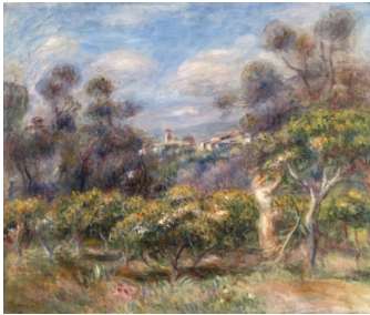
Pierre-Auguste Renoir, La Cueillette des fruits

Stern Pissarro Gallery is thrilled to showcase an exquisite oil painting by the Impressionist master Pierre-Auguste Renoir. With its soft brushstrokes and warm palette, the piece beautifully captures the essence of Renoir's internationally acclaimed landscapes. As 2024 marks 150 years since the first Impressionist exhibition, the inclusion of a Renoir piece of this calibre on their stand is particularly relevant and presents collectors with an exciting opportunity.