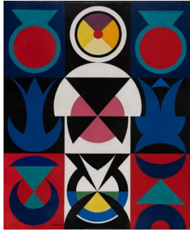
Herbin, VENUS I

across the entire coast of France. The work possesses the classic luminosity that collectors admire in Signac's painting, particularly evident in the vividness of the blues, greens, and oranges adorning the boats.