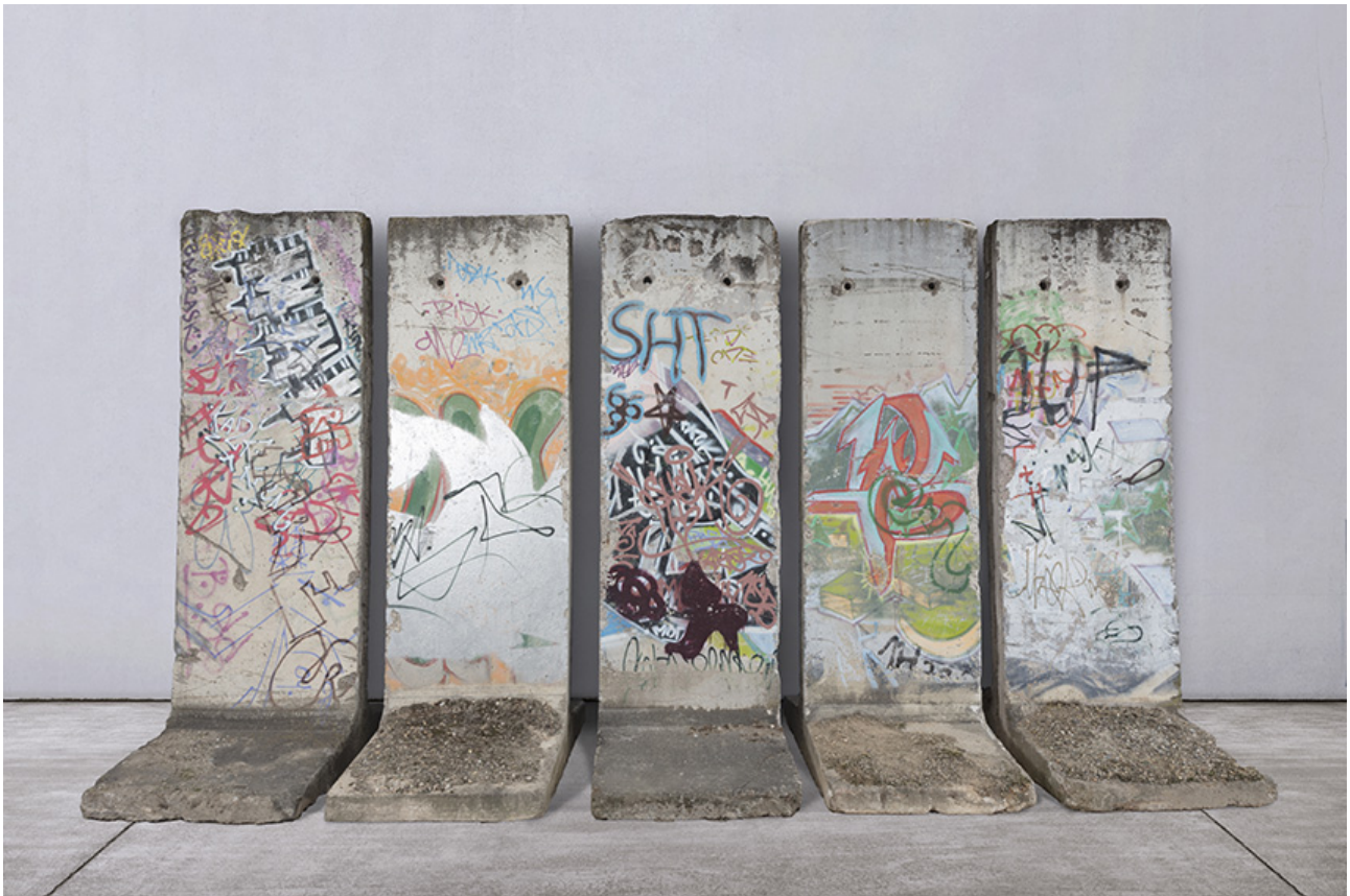
The five segments of the Berlin Wall that will be auctioned off at BRAFA 2020

The proceeds of the sale will be divided among five associations and museums in the areas of cancer research, the social integration of people with disabilities, and the preservation of art heritage.