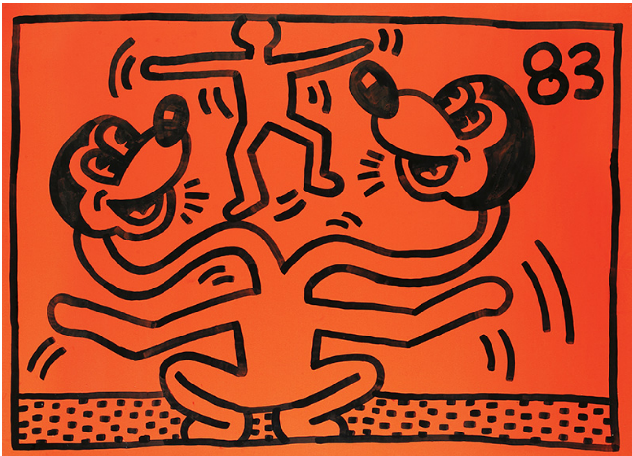
Galerie de la Béraudière – Keith Haring – Mickey Mouse