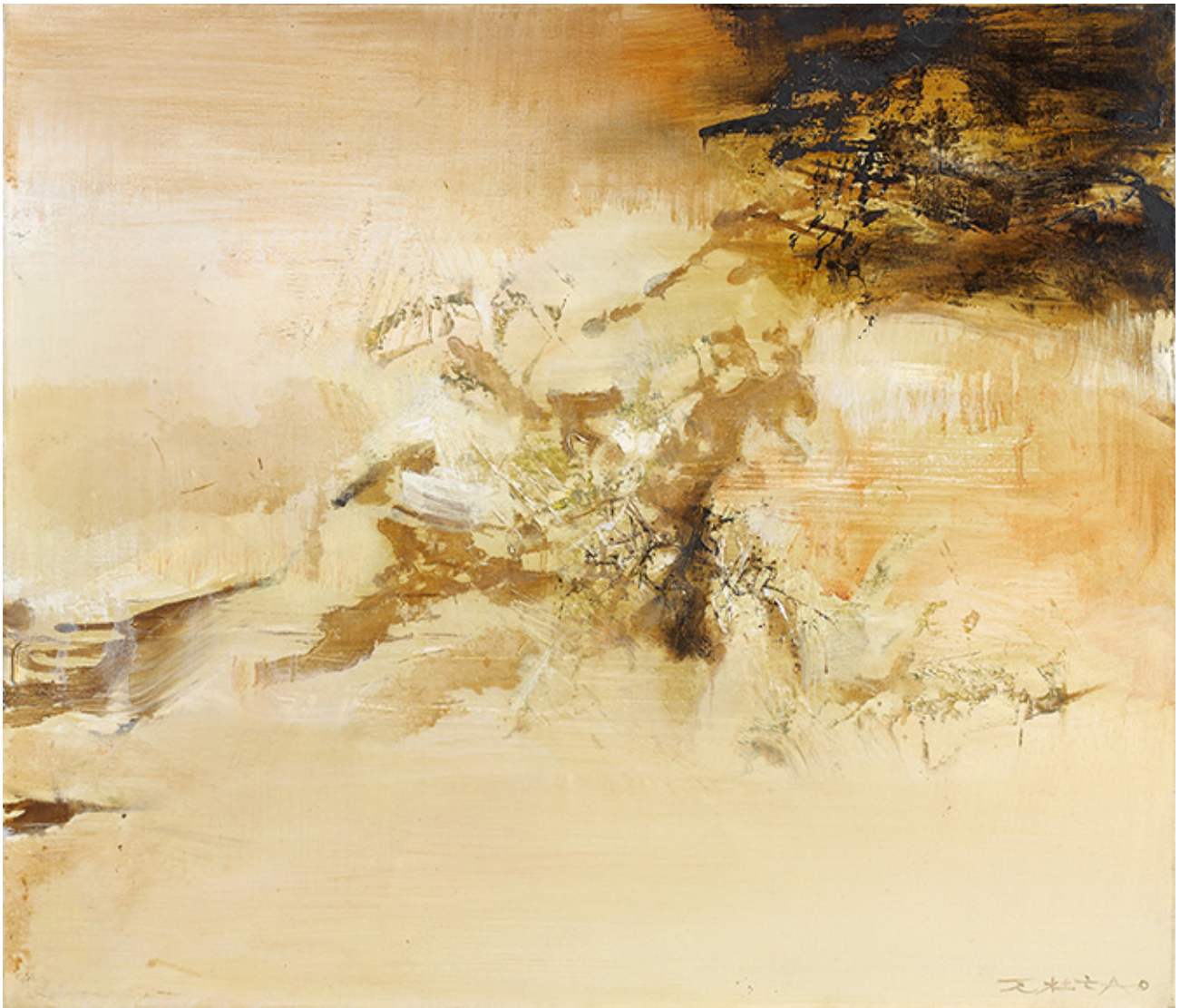
Omer Tiroche Gallery- Zao Wou-Ki – 10.04.70

To see the floor plan, click here . For more information, please visit the official website .