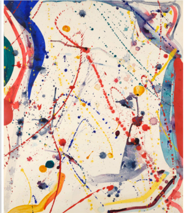
Left: Baronian Xippas – Stanley Whitney – Parisian Blue / Right: Boon Gallery – Sam Francis – Abstract Composition