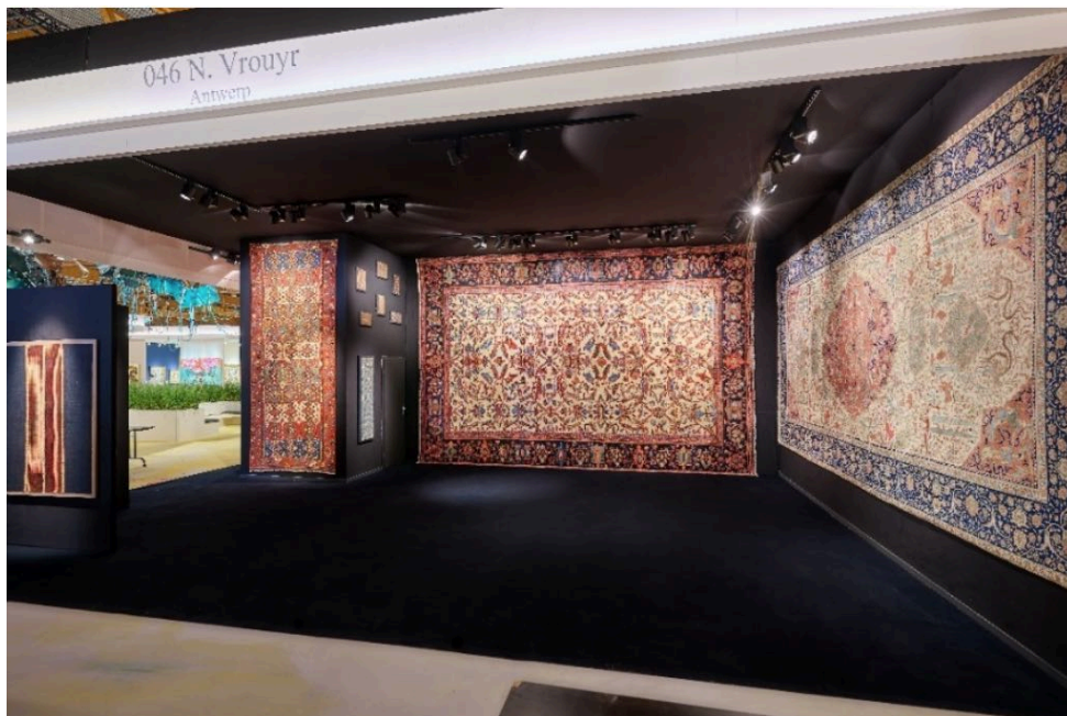
BRAFA 2022 – stand 46 N. Vrouyr

Ancient and modern tapestries – De Wit Fine Tapestries (stand 4) will be presenting a remarkably well-conserved Brussels tapestry of wool and silk dating from 1530 with exceptional colours, illustrating the episode when King Solomon invited his mother Bathsheba to share the throne. On the stand of N. Vrouyr (stand 46), next to an elegant carpet by Petag Tabriz (Iran), discover textiles with shimmering colours by Chinese minorities, including the ceremonial cover of the Dai, Yunnan province. The weavings, with their geometric lines and creative drawings, had an important influence on contemporary art. Finally, the Galerie Latham (stand 96), will be presenting an embroidered work by Annabelle d'Huart (France, 1952), Black Sea Princess, 2013.