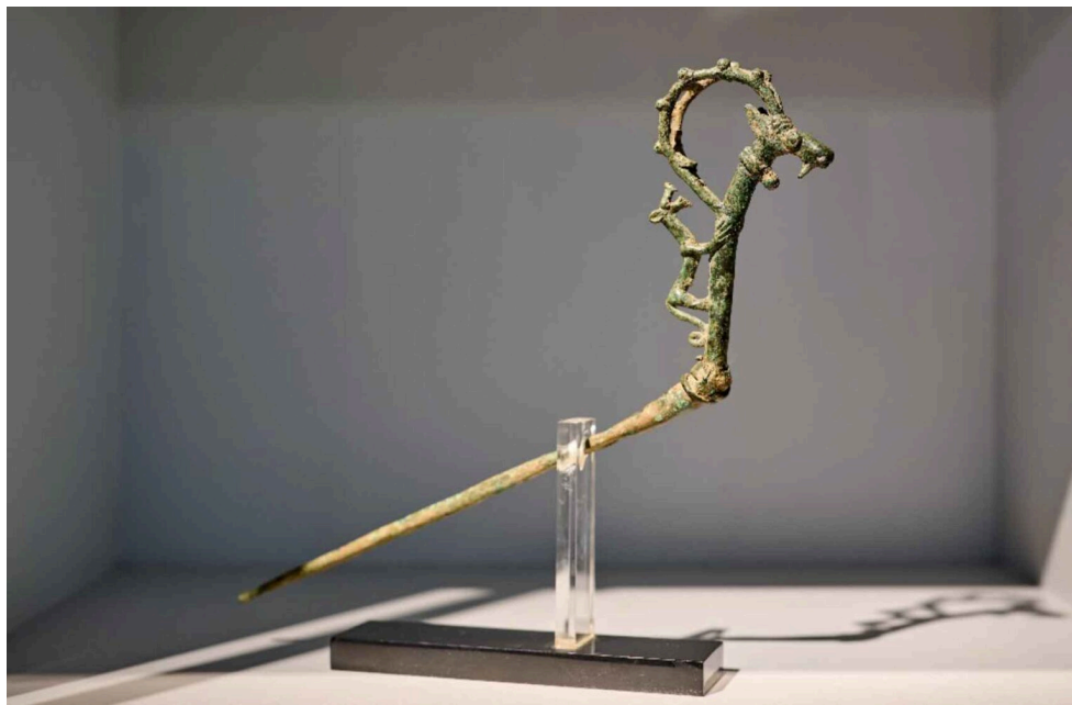
BRAFA 2022 – stand 39 Galerie Kevorkian

Archaeology – For its first participation at BRAFA, the Galerie Kervorkian (stand 16) will present, amongst others, a set of bronzes from Luristan (Iran). Most of them come from a single French collection, including a large and elegant ibex and feline pin from the beginning of the millennium BC.