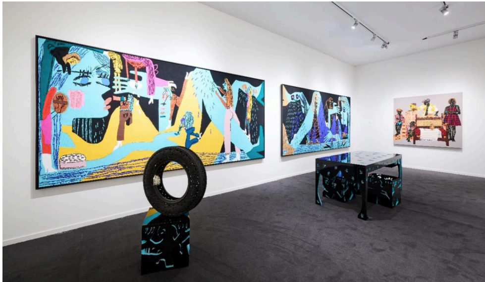
BRAFA 2022 – stand 77 Zidoun-Bossuyt Gallery