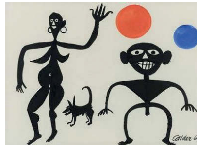
Alexander Calder (1898-1976)