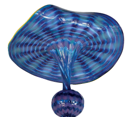
Dale Chihuly (b. 1941)