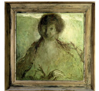
Fidelio Ponce De Leon (1895-1949)