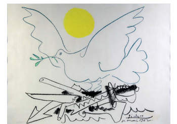
Pablo Picasso (1881-1973)