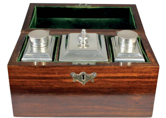
Tiffany sterling tea caddy set