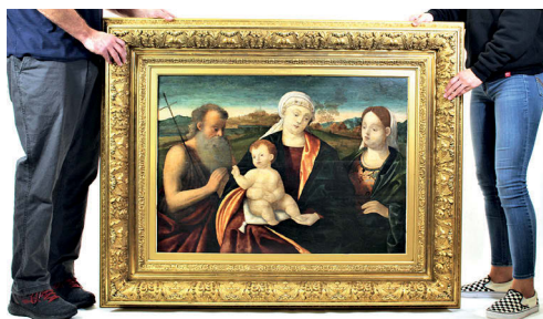
Manner of Jacopo Tintoretto, 16thC Venetian School