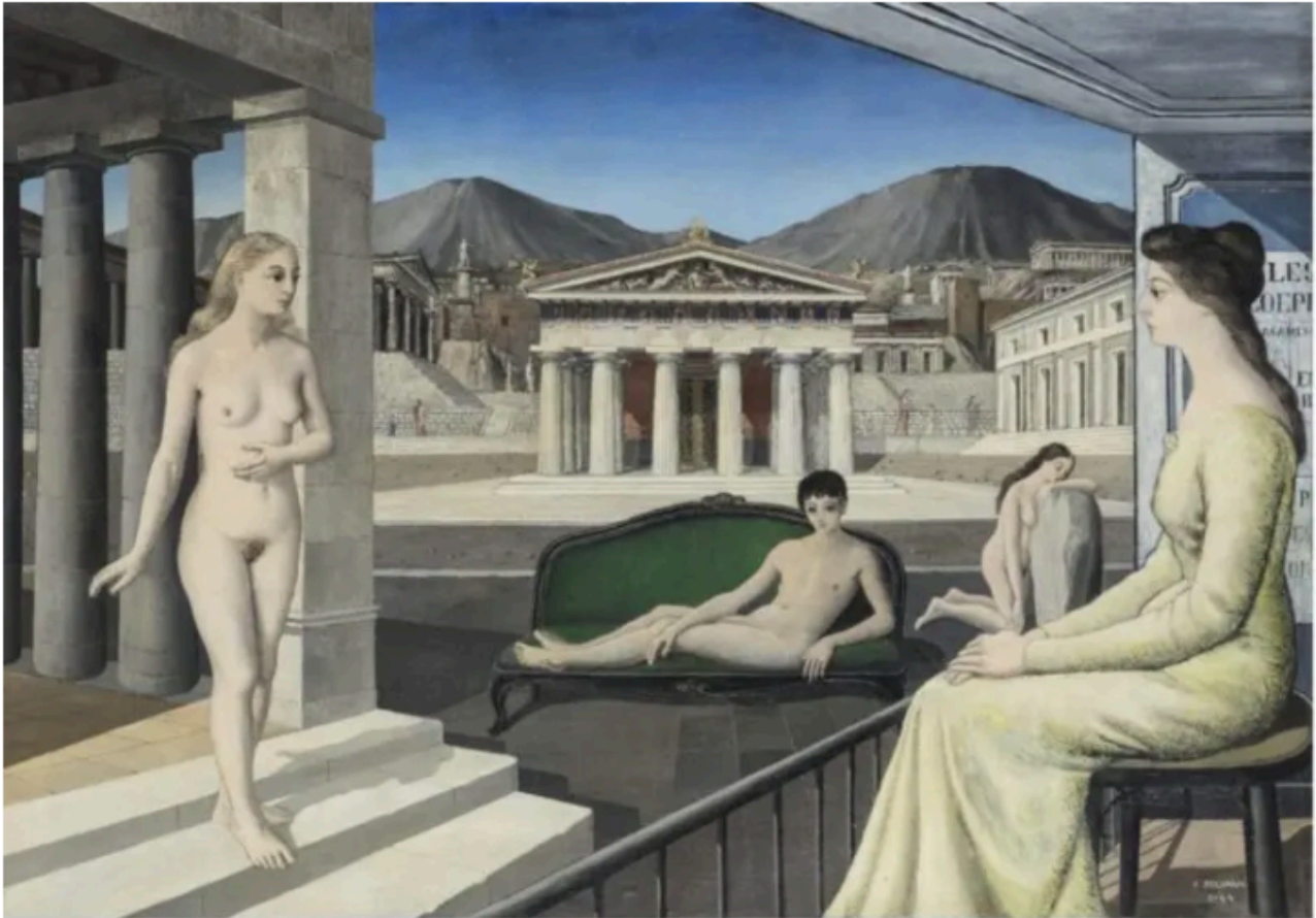
Paul Delvaux (1897-1994), Le Canapé vert, 1944

The Paul Delvaux Foundation will take visitors on a journey into the highly personal world of the artist, whose works, like waking dreams, feature mysterious figures, with women playing a central role, as well as the more unexpected figures of skeletons in ancient architectural settings or railway stations, which particularly fascinated the artist. The ROCAD (Royal Chamber of Art dealers in Belgium) will be exhibiting works on paper by the same artist.