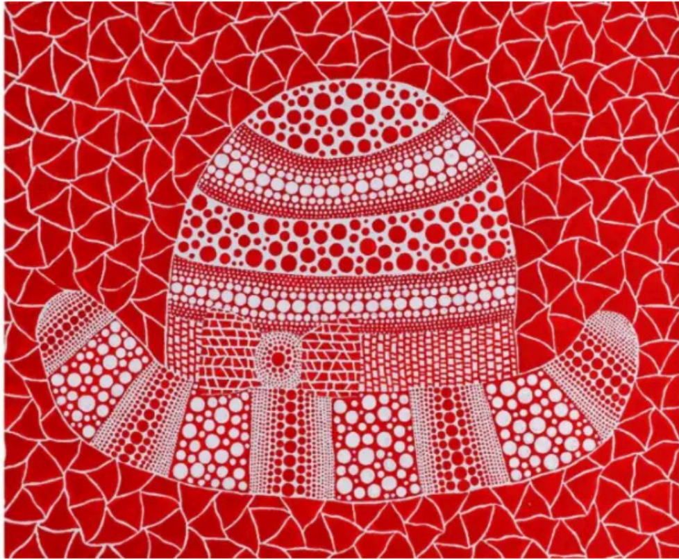
Galerie Von Vertes, Yayoi Kusama, Hat(ATE), 2001