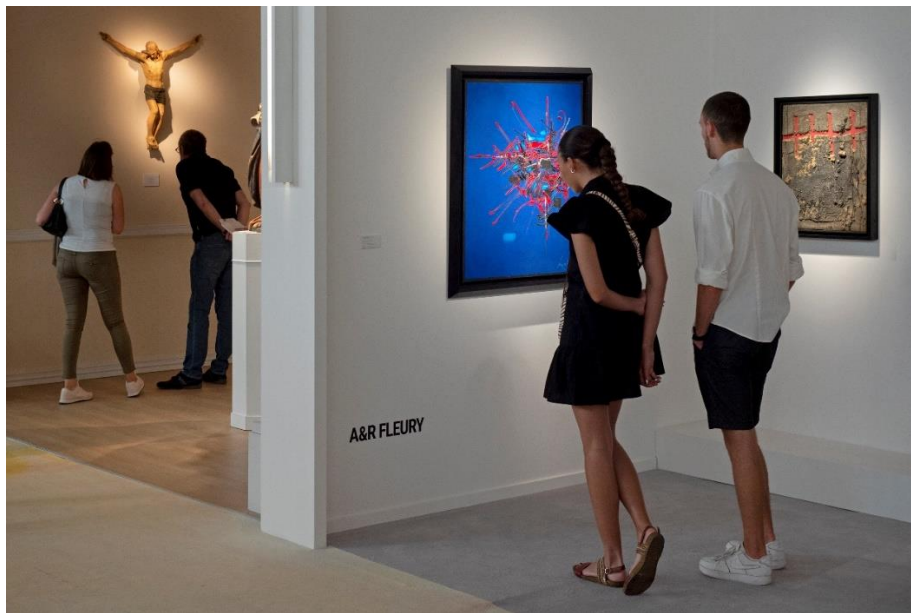
BRAFA Art Fair 2022 - A&R Fleury