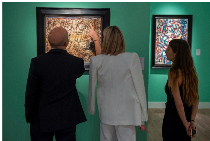
BRAFA Art Fair - Bailly Gallery

For its 68th edition, BRAFA will return to its usual January dates and will be held from Sunday 29 th of January to Sunday 5 th of February, 2023, at Brussels Expo at the Heysel.