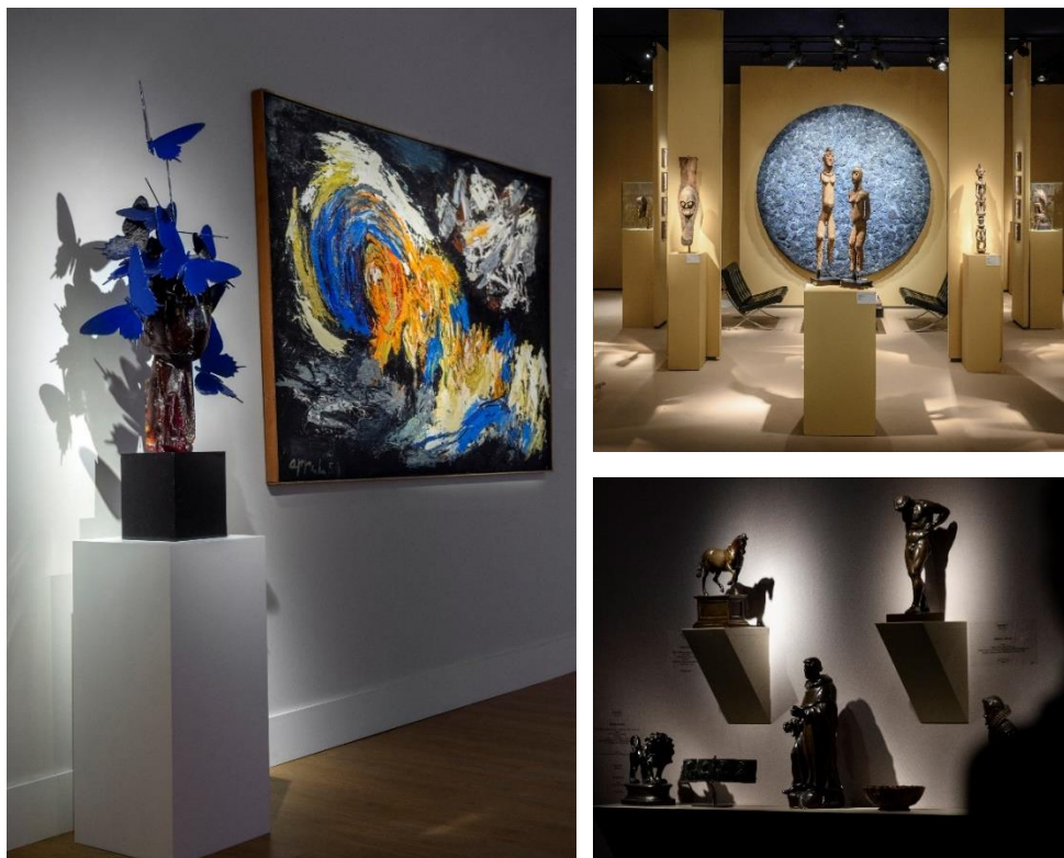
(1) BRAFA 2023 - Opera Gallery (2) BRAFA 2023 - Montagut Gallery (3) BRAFA 2023 – Gallery Desmet