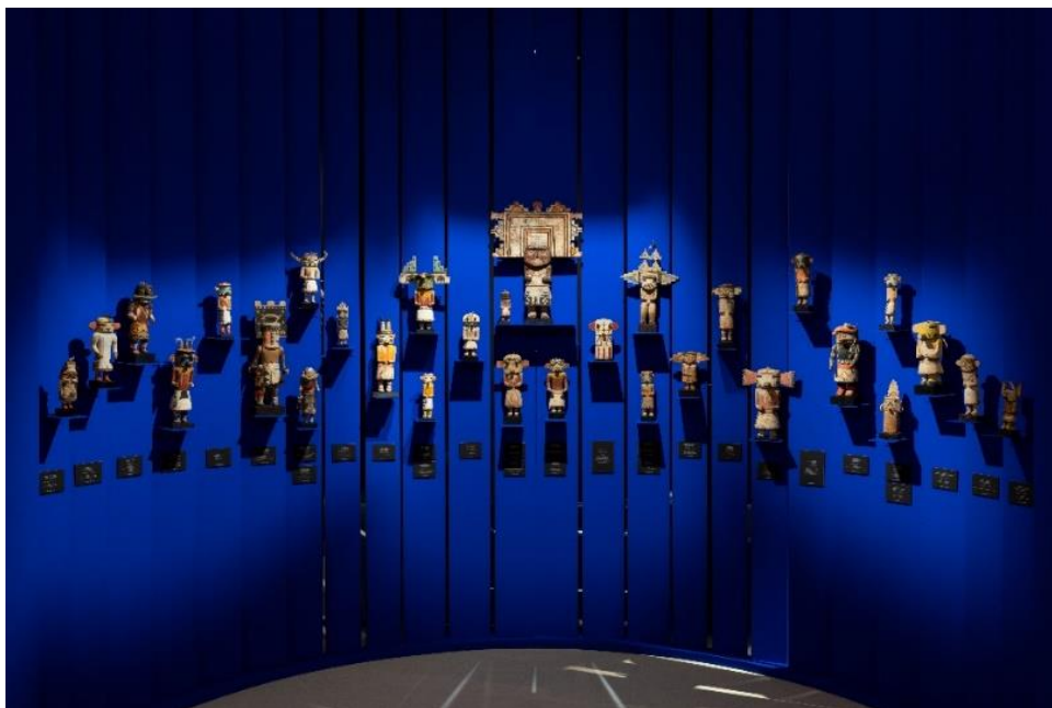
BRAFA 2024 – Galerie Flak

Montagut Gallery (Barcelona) , which specialises in tribal art, sold an eighteenth-century wooden sculpture by the Jörai people of the Highlands of Tay Nguyen, Vietnam. Claes Gallery (Brussels) found a buyer for a Yaure mask, Côte d’Ivoire, late nineteenth-early twentieth century. The mask, which sold for approximately 150,000 euros, was exhibited on a 1946 “suspended” bookcase made of wood, folded sheet steel and aluminium by Jean Prouvé (Paris 1901-1984 Nancy), which was also bought by a collector for approximately 500,000 euros. Galerie Flak (Paris) found buyers for a large part of the works in its thematic exhibition of “kachina” dolls (Hopi culture, Arizona) dating from 1880 to 1930, with prices ranging from 5,000 to over 50,000 euros for each of these sculptures.