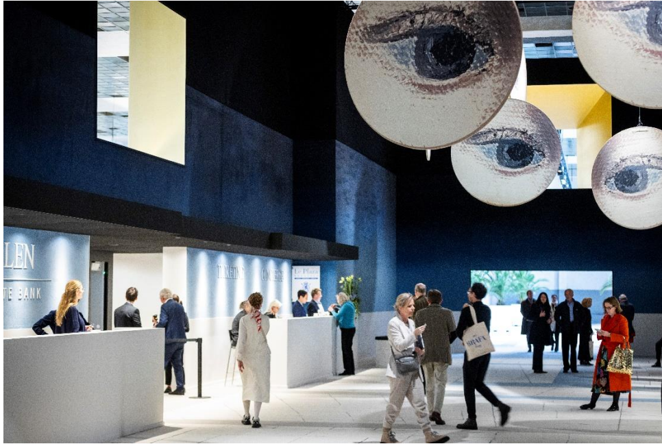
BRAFA 2024 – General View