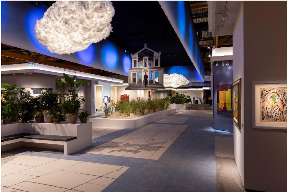
BRAFA 2024 – General View

BRAFA 2024 was another success with record attendance. Nearly 67,000 art lovers of all ages flocked to Brussels Expo over the course of 8 days to discover the 132 galleries on show. As the first fair of the artistic year, BRAFA was unanimously acclaimed by its visitors for both the quality of the objects on display and the magic of the Surrealist décor that characterised the Fair.