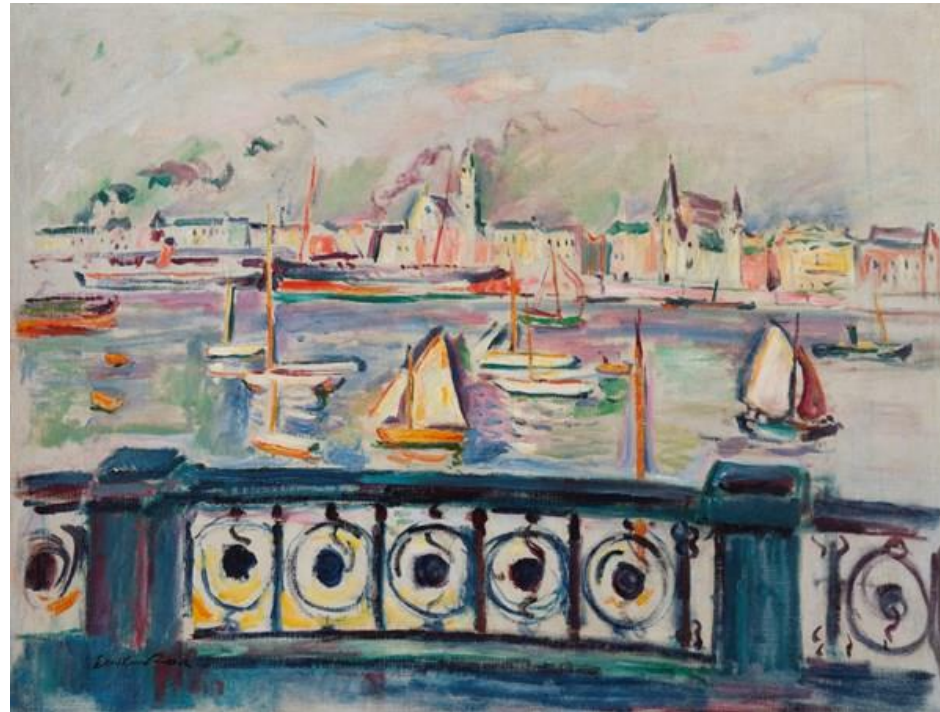
Emile-Othon Friesz (1879-1949), Le port d'Anvers, 1906

In the summer of 1906, Georges Braque and Emile-Othon Friesz decided to go on holiday to Belgium. It was during this trip that the expressive principles characteristic of Fauvism began to be expressed in their work. They stayed in Antwerp on the banks of the Scheldt, at the entrance of the port, and focused exclusively on maritime views, directing their artistic research towards the emancipation of colour. Filled with bright light, this painting is characterised by free gestures and an explosion of pure colours. Emile-Othon Friesz offers a unique view of the port of Antwerp observed from the terrace of the old casino “Le Kursaal.”