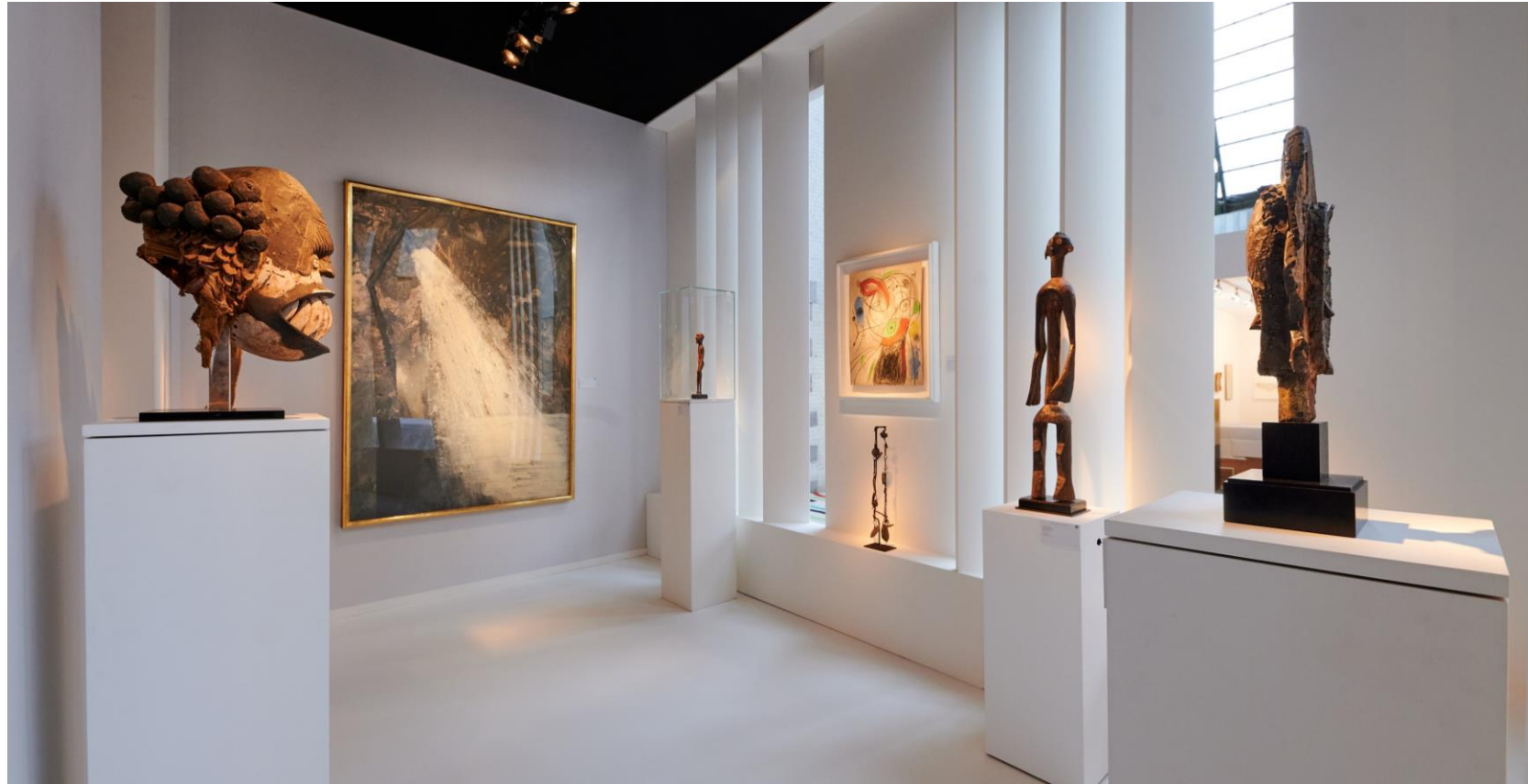
Montagut Gallery, BRAFA 2020

115 prestigious galleries from 15 countries (Austria, Belgium, Germany, France, Hungary, Italy, Japan, Luxembourg, Monaco, Spain, Switzerland, the Netherlands, the United Kingdom, the United States), will present their best works in ancient, modern and contemporary art, from Sunday 19 th to Sunday 26 th of June 2022 at Brussels Expo on the Heysel plateau.