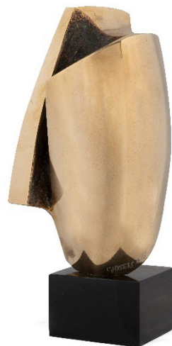
Incantation , 1971 Bronze on Black Mazy marble base Signed "JP. GHYSELS" 26,5 x 12 x 12 cm