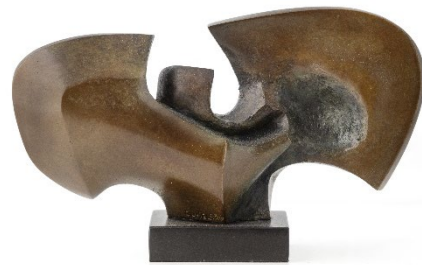
Antioche , 1987 Patinated bronze on Black de Mazy marble base Signed "GHYSELS" 16 x 21 x 8,5 cm