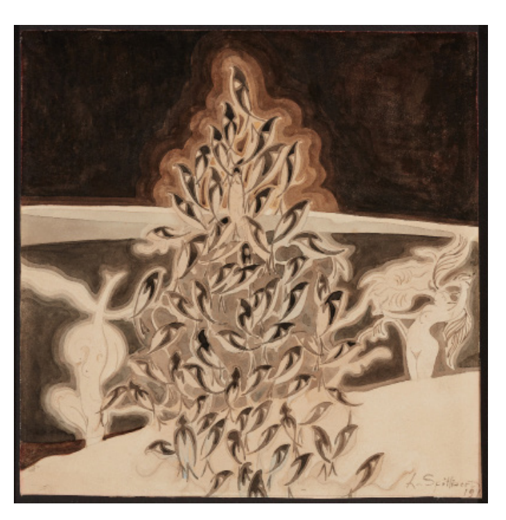
Léon Spilliaert - The dream (1916) - Pencil, Indian ink, pen, acquarel on paper - 25x25 cm Presented at BRAFA 2025.