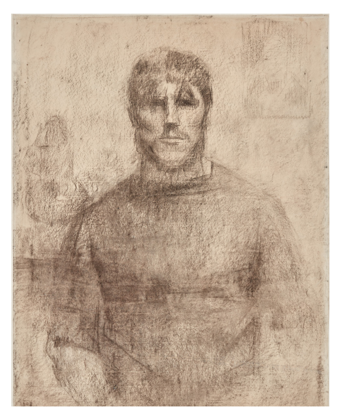
Rik Wouters - Self portrait (1908) - Charcoal on paper - 75 x 57 cm. Presented at BRAFA 2025.

The work is more than a caricatural presentation of «Les Compagnons de l'art»,. Brusselmans tells in one image the story of artistic connection and friendship. It is a hommage to the work of the brothers Haesaerts, for what they meant to Jean Brusselmans but as well to the Belgian art scene at the time and at another level for artists and people that come together in affection for each other and for the arts.