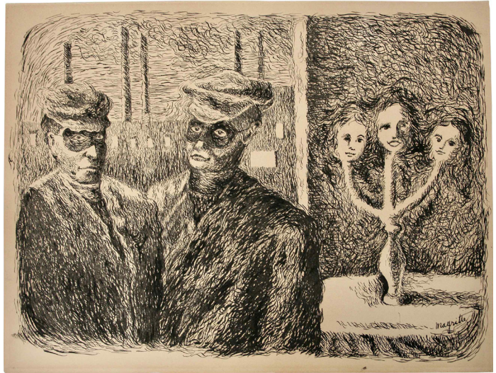
René Magritte - The Intelligence (1946) - India ink op paper - 22,1 x 19 cm. Presented at BRAFA 2025.