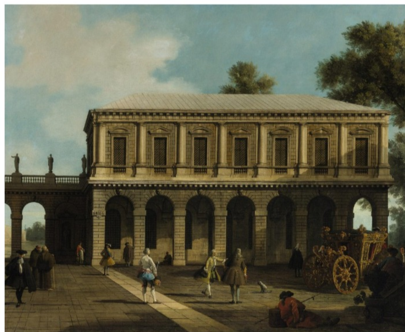
DYS44 Lampronti Gallery : Giovanni Antonio Canal (Venice, 1697–1768), Capriccio of the Prisons of San Marco, circa 1744. Oil on canvas, 105.5 x 127.5 cm

Known for its unwavering commitment to quality and authenticity, each piece on display at Brafa has been carefully evaluated by a panel of 100 international experts. This thorough vetting process guarantees that those in attendance can make purchases with confidence, assured that they are investing in genuine artworks.