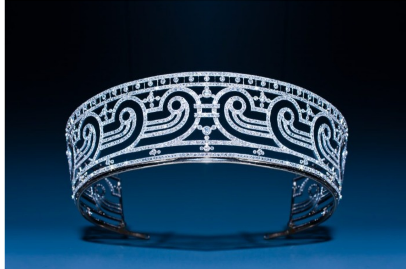
Art Deco diamond tiara, Maison Chaumet , Paris 1909

The fair's 70th edition coincides with the 100th anniversary of the 1925 International Exhibition of Modern Decorative and Industrial Arts in Paris, widely recognised as the birth of the Art Deco movement. The Brussels-Capital Region will celebrate this milestone with a year-long initiative to highlight its Belgian heritage through a series of cultural events, and Brafa will kick off the festivities, joining the country's museums, institutions and foundations in marking the iconic art movement's centenary.