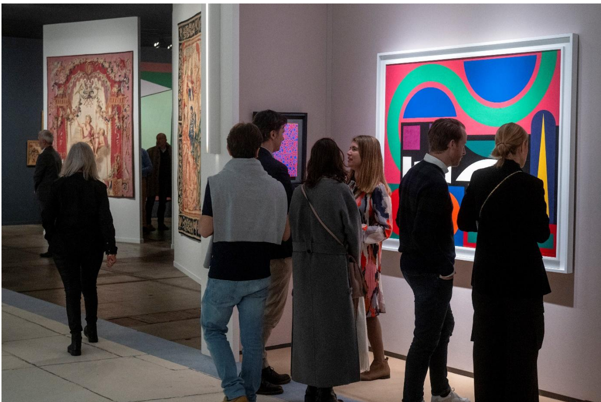
BRAFA 2024