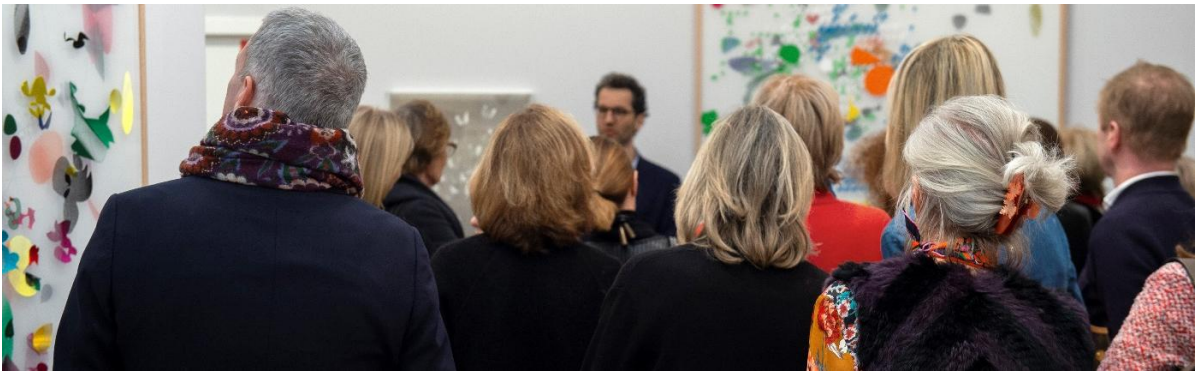
BRAFA Art Tours

Each year, BRAFA broadens its programme with the BRAFA Art Talks, a series of captivating lectures given by curators, experts and other key figures from the Belgian and international art scenes. These talks will take place every day at 4 p.m. on the stand of the King Baudouin Foundation. The BRAFA Art Tours, public tours in English, French and Dutch, will also be organised every day at 3 p.m., offering visitors an in-depth exploration of the treasures on display.